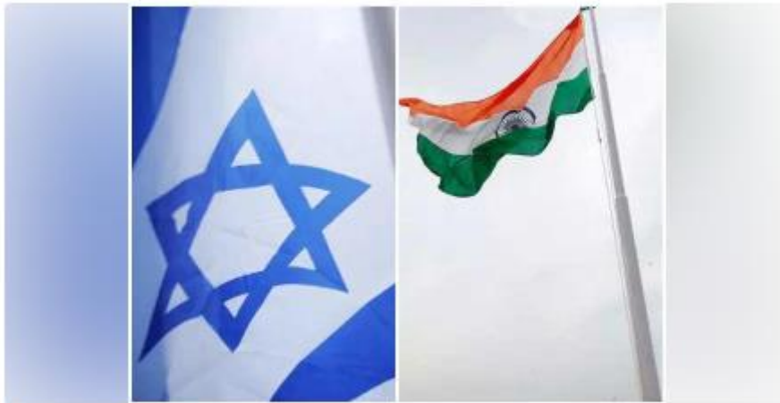
Israel seeks 10,000 Indian construction workers, offering Rs 1.92 lakh/month salary

N ew Delhi: Israel has approached India recently to carry out a recruitment drive again for 10,000 construction workers and 5,000 caregivers simultaneously to plug the skill gap in infrastructure and health sectors, the National Skill Development Corporation said. This comes on the back of a similar request made by Israel earlier this year, the NSDC said.