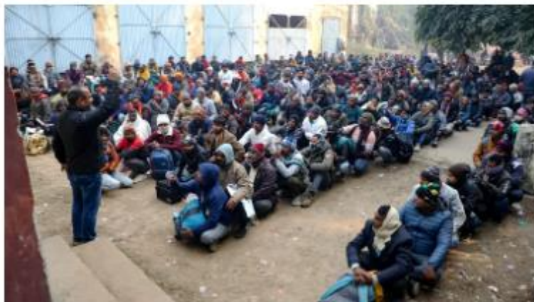
Indian workers gather to seek employment in Israel during a recruitment drive at the Industrial Training Institute (ITI) in Lucknow, Uttar Pradesh.

Those selected will earn a monthly salary of Rs 1.92 lakh, along with medical insurance, food and accommodation. A bonus of Rs. 16,515 per month is also provided.