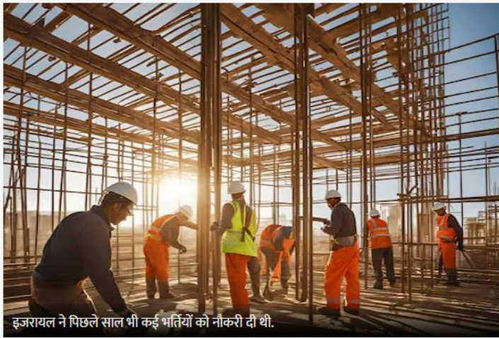
इजरायल ने पिछले साल भी कई भर्तियों को नौकरी दी थी.

इजराइल ने बुनियादी ढांच और स्वास्थ्य क्षेत्रों में स्किल्ड लेबर की कमी को दूर करने के लिए 10,000 निर्माण श्रमिकों और 5 ...अधिक पढ़ें