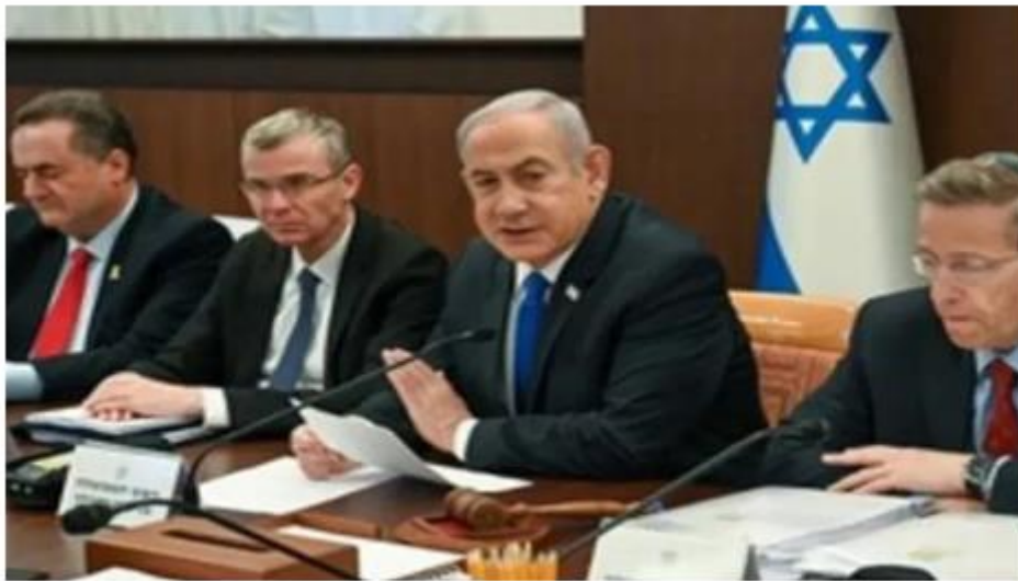
15 हजार भारतीयों को इजरायल में मिलेगी नौकरी