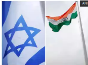
Israel working to bring more Indian construction workers

Israel has approached India to recruit 10,000 construction workers and 5,000 caregivers to address skill gaps in infrastructure and healthcare. This follows a similar request earlier this year. The recruitment drive will be conducted by the National Skill Development Corporation, with candidates undergoing skill tests and pre-departure orientation training.